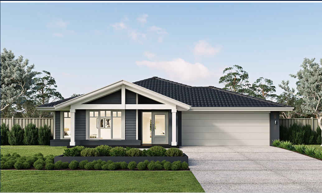
Price excludes: Fencing, Landscaping, Concrete pavers, Planter boxes, Decking