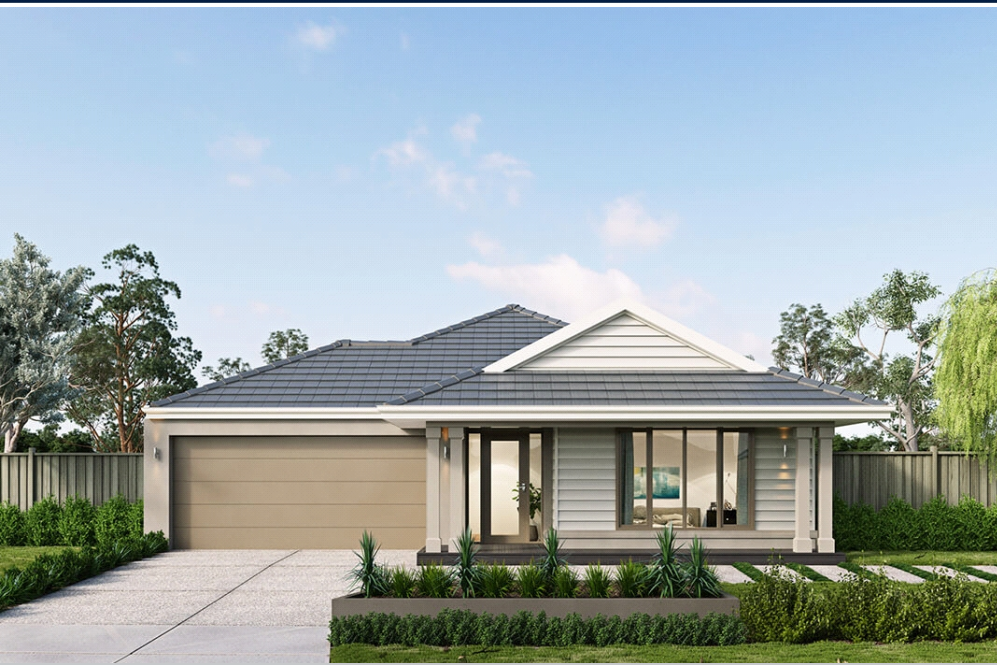
Price excludes: Fencing, Landscaping, Concrete pavers, Planter boxes, Decking